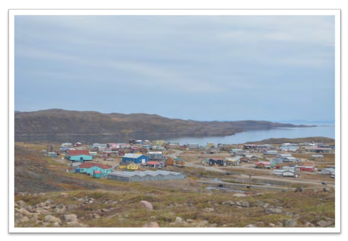
Iqaluit, Nunavut, Canada

The consensus is clear among global experts requesting a "Deeper understanding of the social impacts of AI in diverse social settings"<sup>12</sup>. Yet that engagement is not possible without an understanding of AI's potential and risks which is the core of our next section.